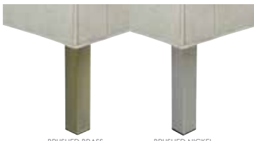
(M) Metal Leg (h8"; Choose metal color: Brushed Brass or Brushed Nickel)