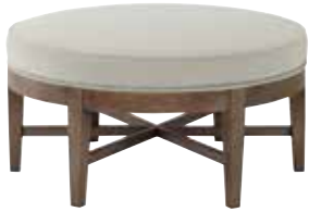
(F) Framed Base (h14"; Features 6 legs, Available in all finish options) Available with (N) Single Row Nails Only