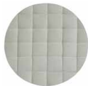
(Q) Box Quilted