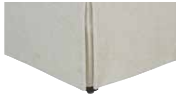
(S) Skirted (Features 4 legs; Casters standard; Nails not available)