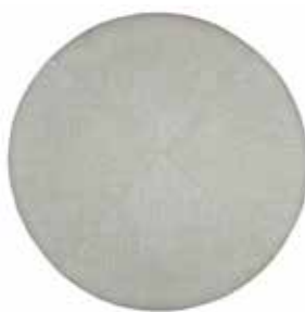
(M) Mitered Top