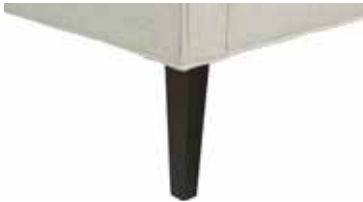
(W) Wooden Leg (h8"; Features 4 legs, Available in all finish options)