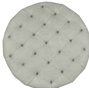
(T) Hand Tufted

step 3: select a nail option (available with small nails only)